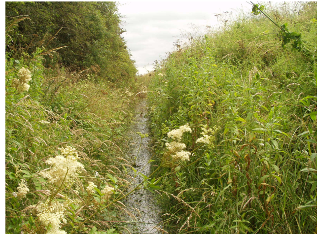
Candley Beck Drain

Where possible, without creating additional undue risks of flooding, leaving a fringe of uncut vegetation at the waters edge in watercourses of an appropriate size helps stabilise the toe of the banks and provides over wintering shelter for insects and small mammals.