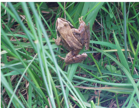
Common Frog Rana temporaria

Bank-side and waters-edge planting will be undertaken as part of a required capital work project or as part of bank stabilization work where appropriate to provide cover, shelter and food for aquatic and terrestrial species.