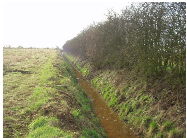
North Kelsey Cross Drain

This ensures clear passage for flow within the watercourse, provision for increased capacity during wetter winter months, stimulates bank side vegetation that maximises bank side protection and provides suitable food source for species such as water vole and allows inspection of Board asset structures.