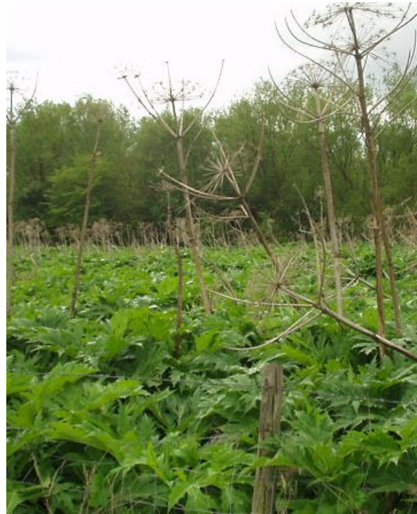
Giant Hogweed Heracleum mantegazzianum

Any Invasive Non Native Species identified on or in Board maintained watercourses will be reported to the GB Non Native Species Secretariat.